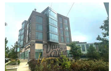
Van Aken District Shaker Heights, OH

Structural Engineers Association of Ohio American Institute of Steel Construction Steel Framing Alliance Cold-Formed Steel Engineers Institute