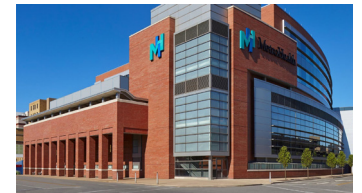
MetroHealth System Cleveland, OH