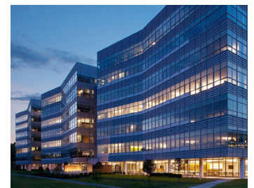
Goodyear Headquarters Akron, OH