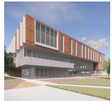
Ohio University (HCOM) Phase I Expansion Athens, OH