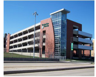
Cleveland State University East Parking Structure Cleveland, OH