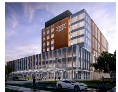
The Ohio State University Wexner Medical Center Columbus, OH