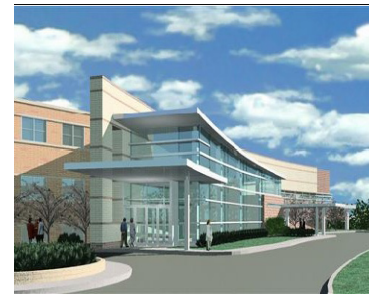
Bucyrus Community Hospital South Expansion & Interior Renovations Bucyrus, OH